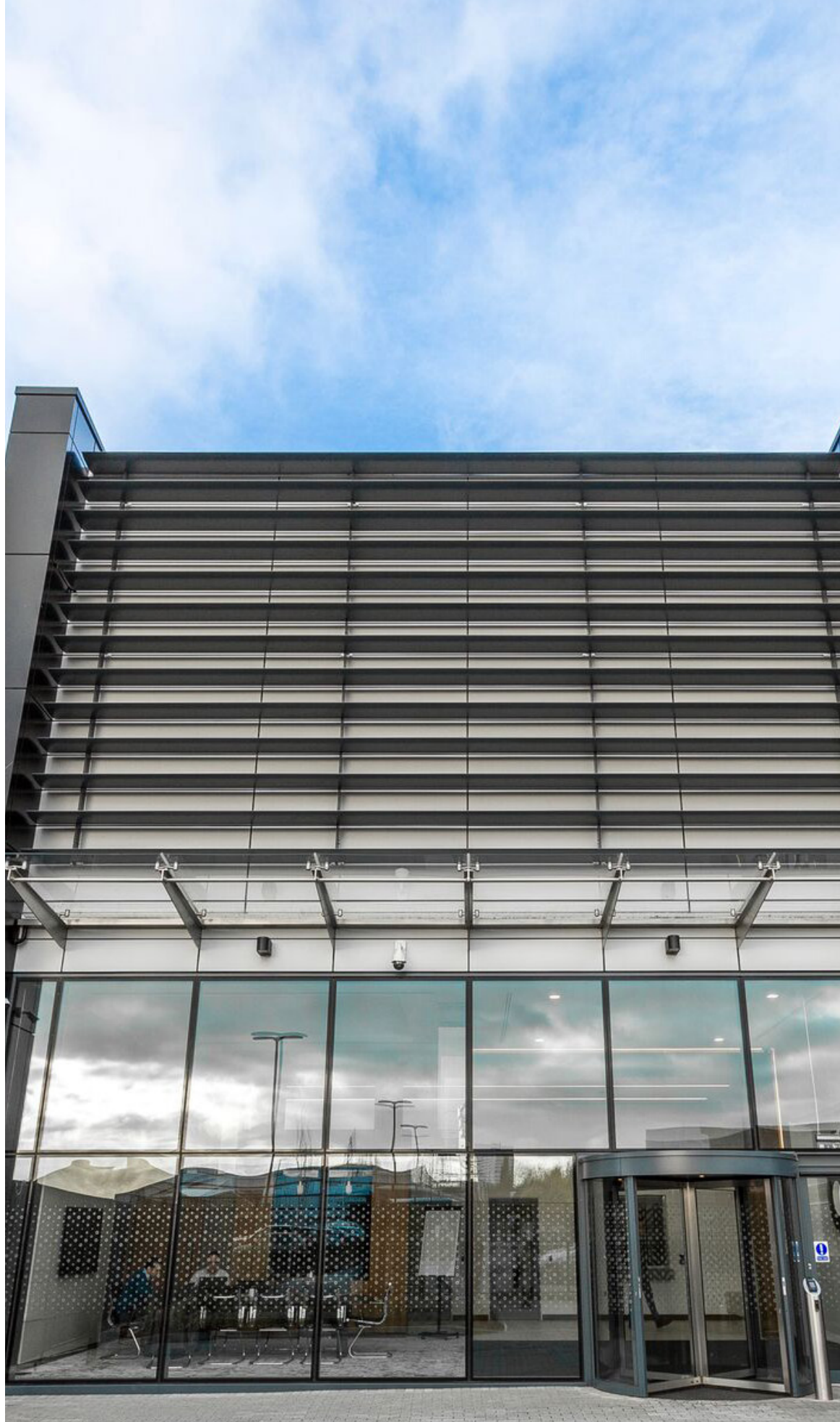
BIRMINGHAM CENTRAL DATA CENTRE Front entrance