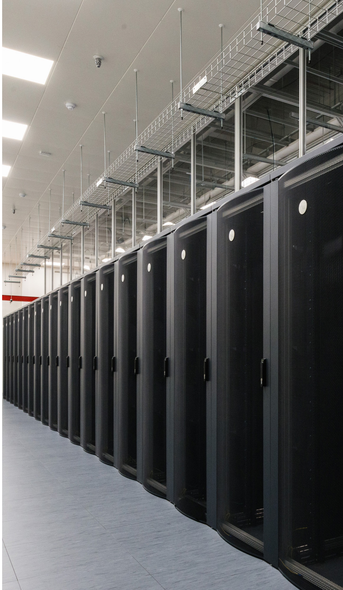
BIRMINGHAM CENTRAL DATA CENTRE Rack cabinets