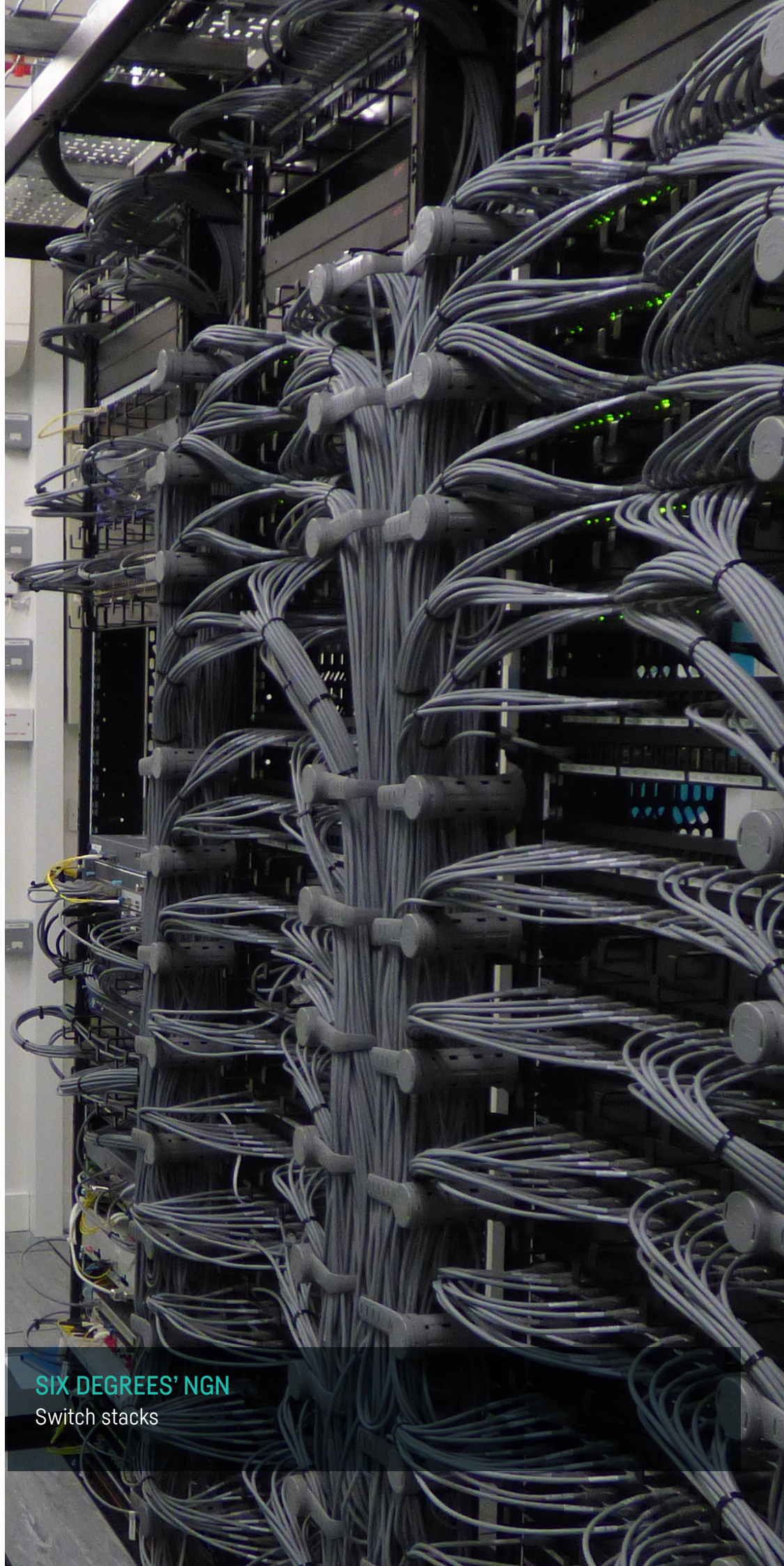
SIX DEGREES' NGN Switch stacks