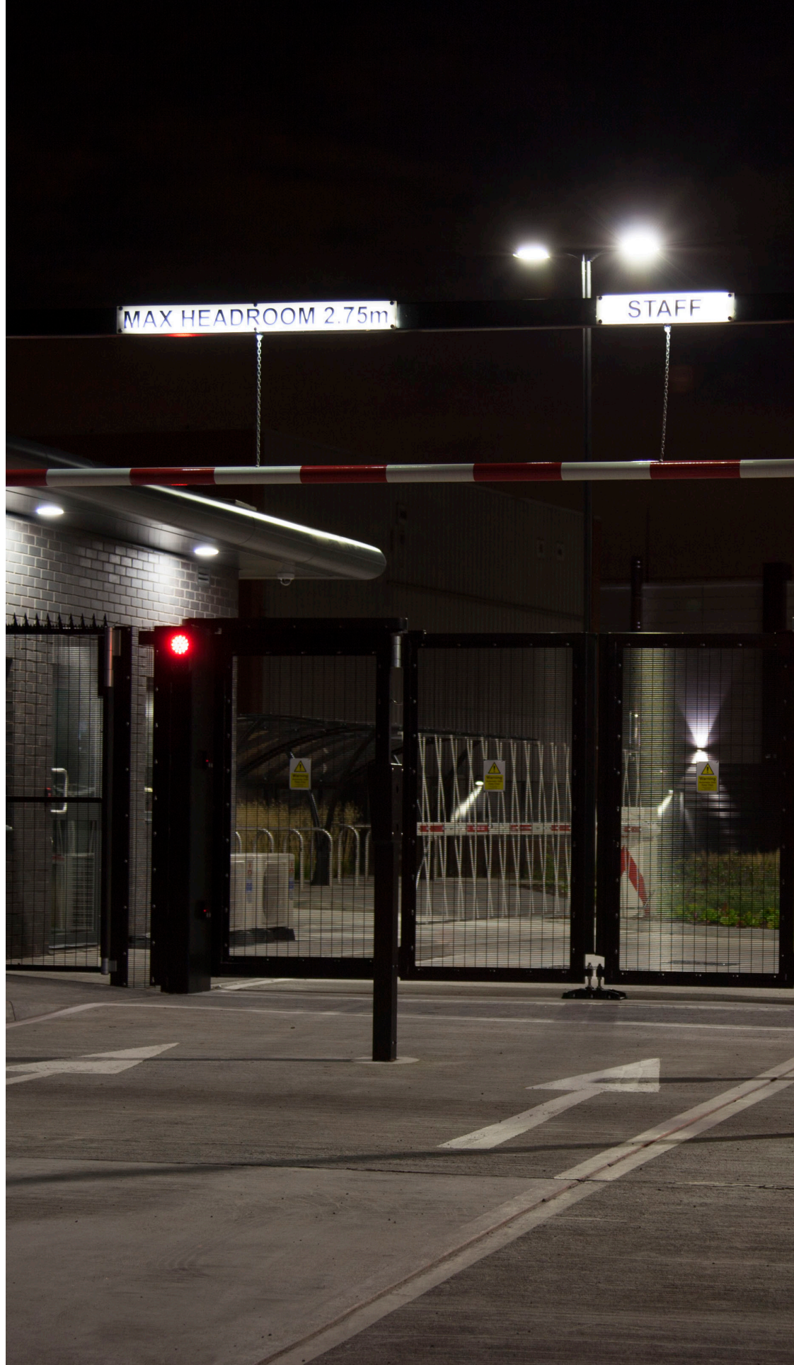
BIRMINGHAM CENTRAL DATA CENTRE Front entrance driving lanes