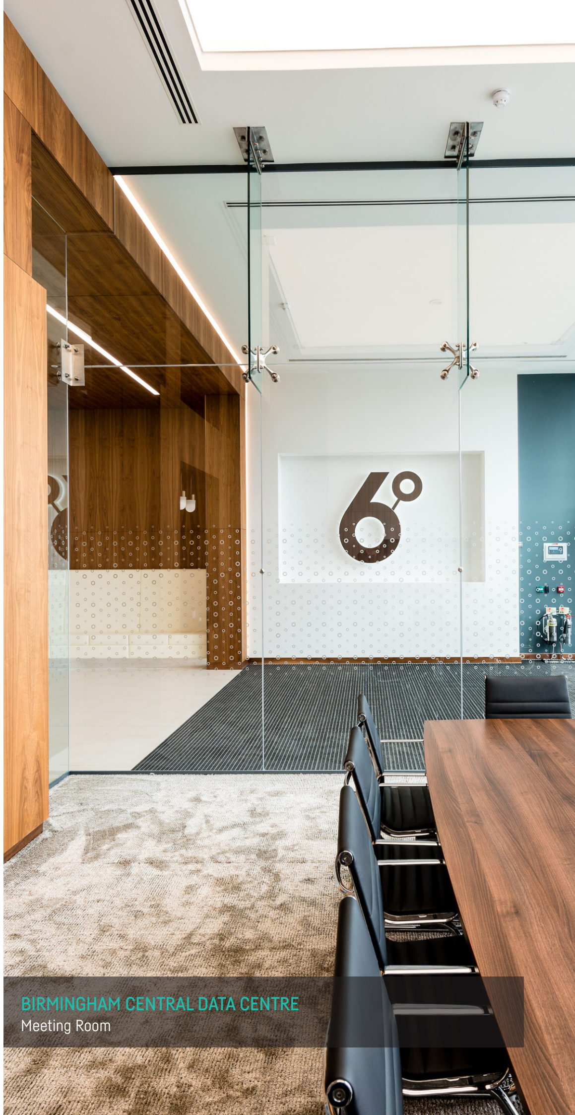
BIRMINGHAM CENTRAL DATA CENTRE Meeting Room